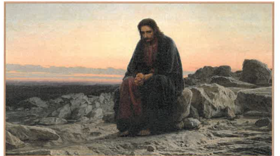
Christ in the Wilderness by Ivan Kramskoi, 1872