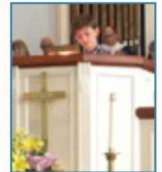
Christian Education Sunday