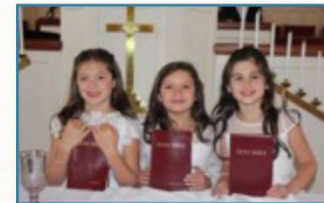
3rd Grade CBW