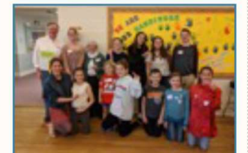
All-Church Birthday Party