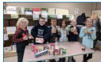
Family Food Pantry Day